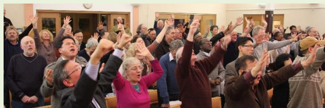
Intercede prayer meetings: Feb 2014 (above), Jan 2015 (below)

2012. It has now entered into the 6 th year. We have been praying for our nation and for our town of Brentwood.