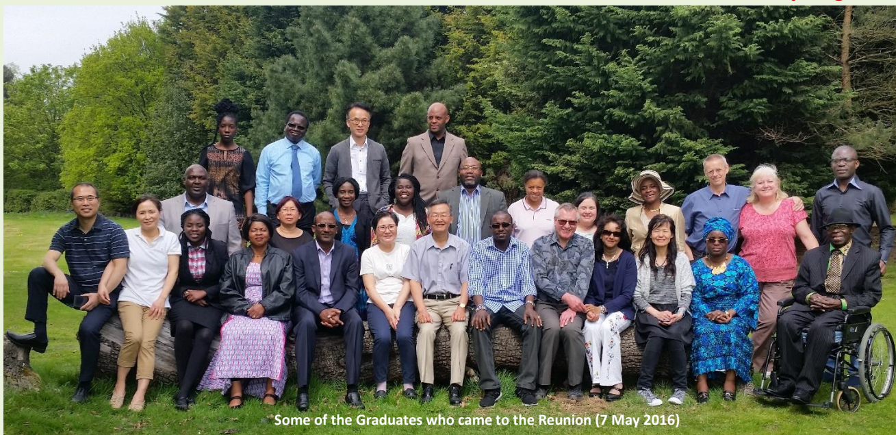
Some of the Graduates who came to the Reunion (7 May 2016)