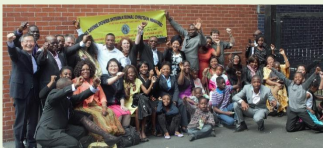
The first church plant by an Amnos graduate (Liverpool, 18.5.2014)