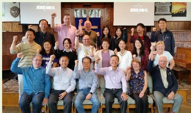
An Arise team and hosting church members in Wales during Arise 2016

We already have 17 churches, including four in Wales, who would like to invite the Arise teams. Some seven to nine churches in America have indicated sending people to support the UK churches with evangelistic manpower. For details and to apply, visit www.arise-europe.org .