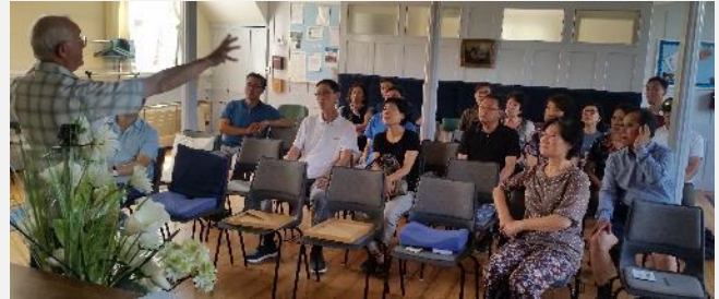
A team from Virginia, USA, visited a small church in Colchester where Charles Spurgeon was converted by a simple message at the age of 16.

Amnos has been hosting this Heritage Tour annually since 2013. It is to encourage Korean American church leaders to see the beautiful Christian heritage sites such as those of John Bunyan, John Wesley, William Carey, the Puritans and the Welsh revival . They also have opportunities to see the current spiritual climate of the UK, so they can pray more for the UK and for Amnos. A group from New Jersey, USA is coming 20-25 May, 2019.