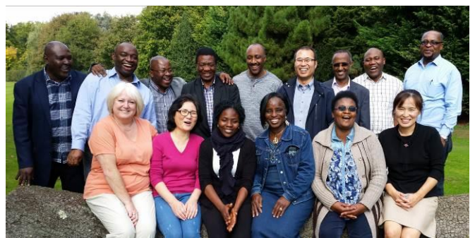
The Class of 2014-2015

Thank you for your prayers and your partnership with us. Your prayers and financial support for Amnos are invaluable for this work. Grace and peace from our God to you all.