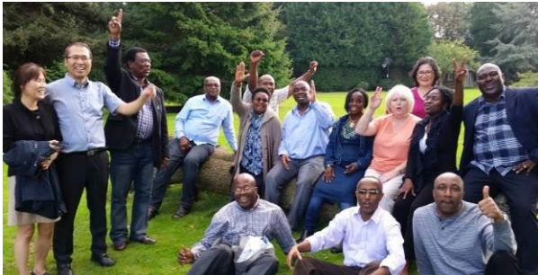
A real sense of a team and family. The new students are highly motivated, committed and passionate for the Course.

We are grateful to the Lord for entrusting us with the people whom He has called. We feel privileged and responsible to equip them to be church planters and pastors. The Orientation Week went very well for them to get to know each other including the staff, and also to grasp the overall picture of the Course.